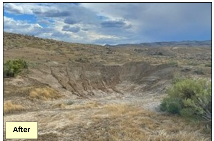
Above is an example of "Livestock Water Systems & Pond Maintenance" projects funded by the Districts