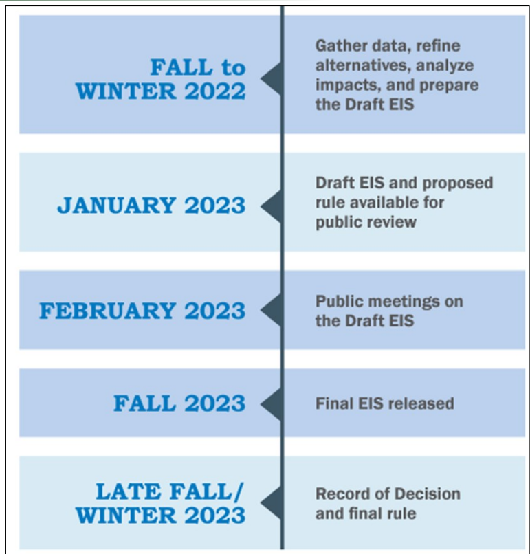
US Fish and Wildlife Services NEPA Process Reintroduction of Wolves into Colorado

The Districts have been heavily engaged in the public engagement process of wolf introduction at the State and federal levels. Staff have attended and provided comments at the SAG and CPW Commission meetings regarding the impacts of wolf introductions to Rio Blanco County and citizens.