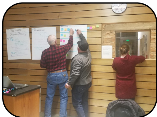
Left: Local citizens place their river priorities under the specific heading at a public meeting in Meeker.