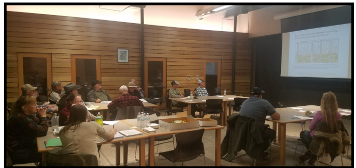
Community members at public meeting in Meeker.