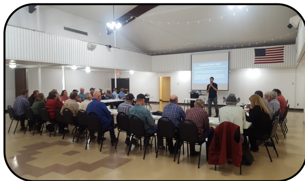
Right: Landowners attend an info-session on why a planning effort is important to agriculture in the White River Basin.