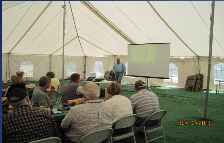
Lunch At the YMCA of the Rockies in Frasier, Colorado

The YMCA has spent over $1 Million Dollars removing dead trees through out their property